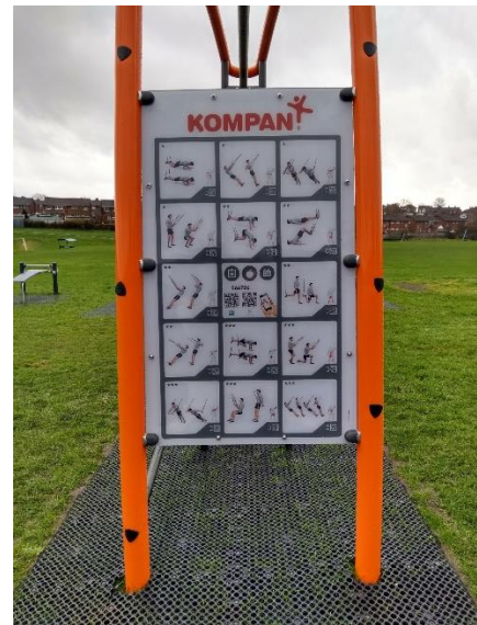
Outdoor Gym at South Street Recreation Ground, South Normanton