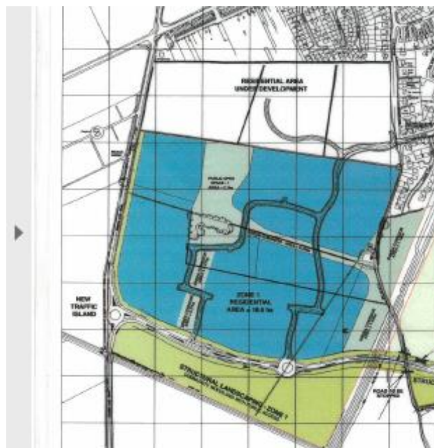
South Shirebrook Masterplan